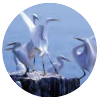
City Bird: Egret