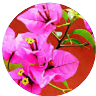
City Flower: Bougainvillea

Xiamen enjoys strong economic, trade and cultural ties with lots of countries and regions around the world. It is the sister city to 24 international cities. Various elements from its sister cities have been integrated into the urban development of Xiamen, such as the “Wellington Road” and “Surabaya Road” in Wuyuan Bay. Many rare instruments on display in the Kulangsu Musical Instrument Museum are from sister cities as well. Likewise, many Xiamen elements have travelled across the oceans and been brought into its sister cities, such as the sculpture of Xiamen Marathon in the Greek city of Marathon and the sculpture of the Goddess of Egret situated in “Xiamen Park” in the Japanese city of Sasebo.