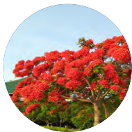
City Tree: Delonix regia